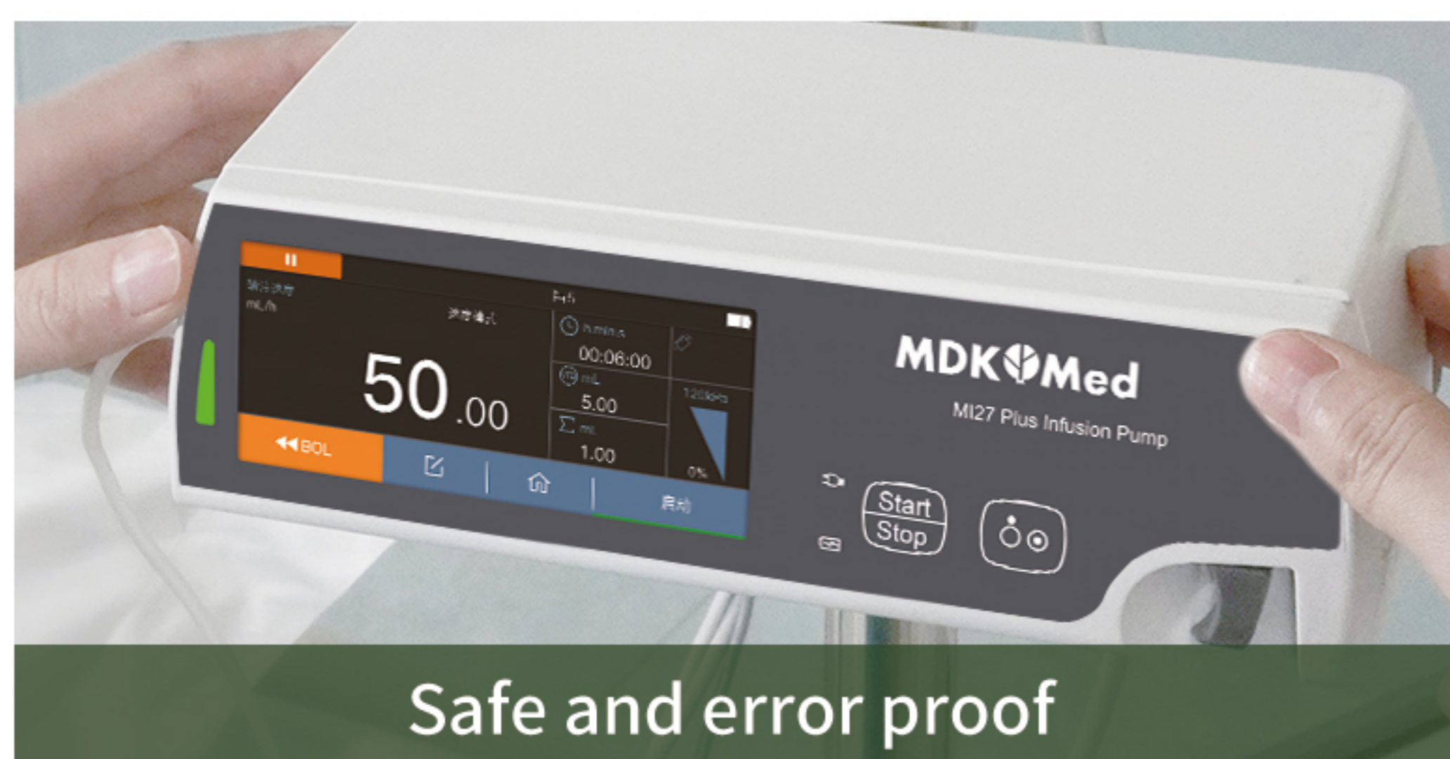
Safe and error proof