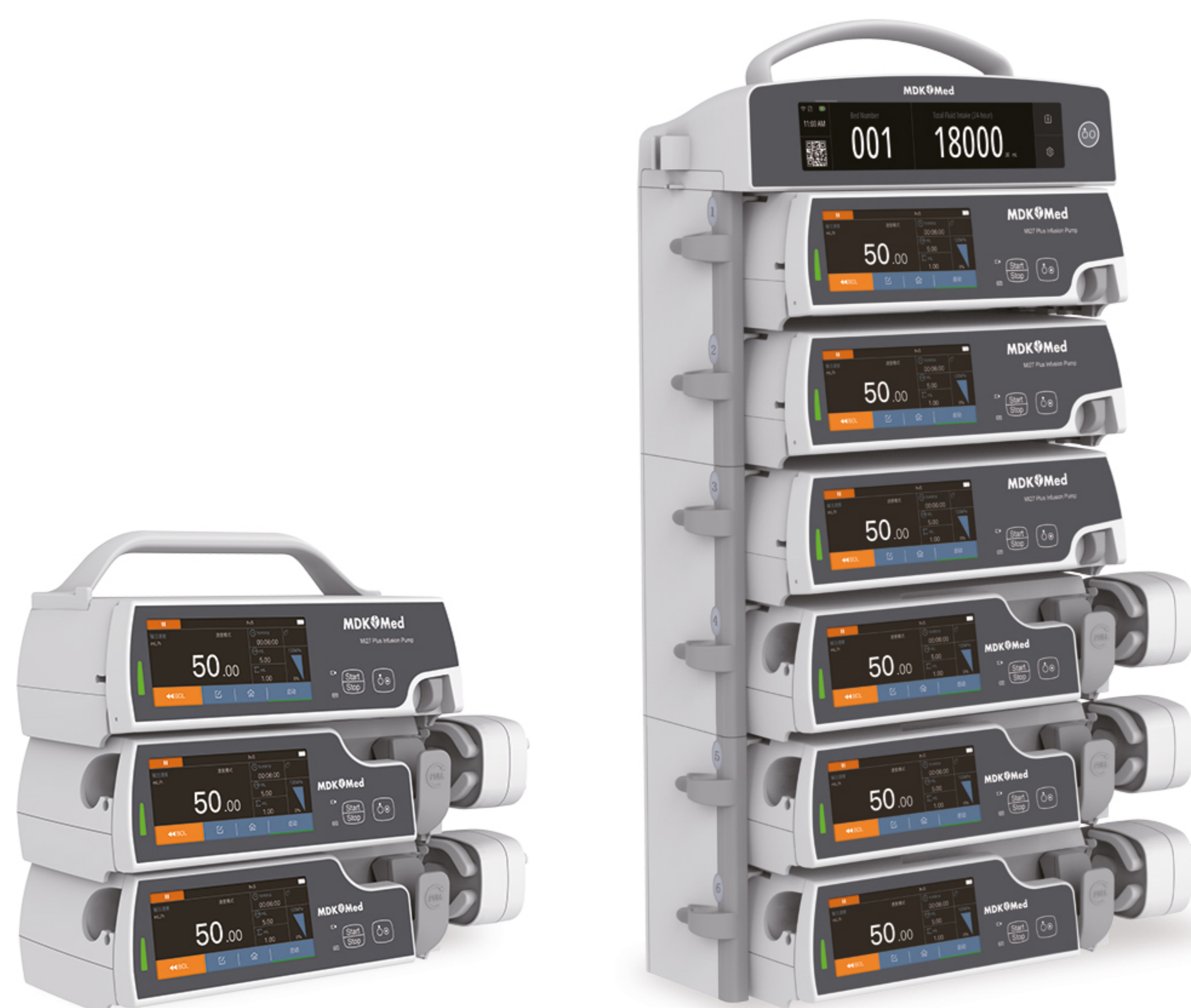
Free combination of multiple channels

Triple dose anti-stall design, ten safety measures for infusion